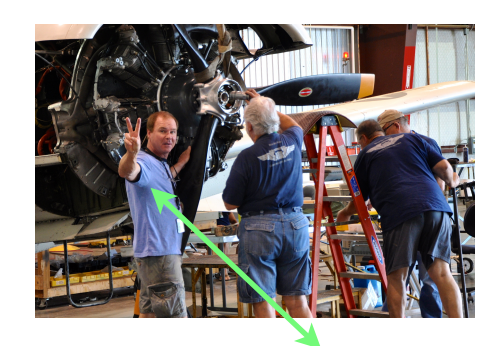
It's not always about work

So that is it. Again, nothing is cast in cement. Members of the Air Base committee will be traveling to the Arizona Wing to observe their operations, as they are effectively an Air Base. This will give us a better understanding of operating a large campus beyond the immediate "grasp" of HQ. As I see it, we have no alternative to making this plan, whatever its final form, work. The existence of the High Sky Wing and of the CAF in the Permian Basin hinges on our efforts. I believe we are up to the challenges, and I will enjoy working with all of you to make Air Base West Texas a success.